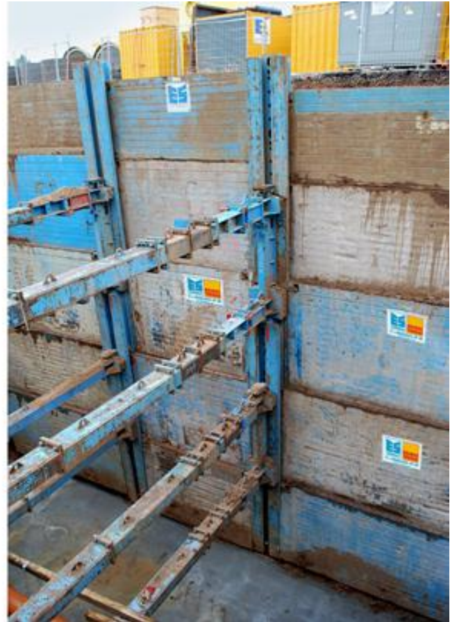
↑ Deep Linear shoring